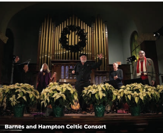
Barnes and Hampton Celtic Consort