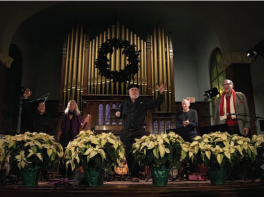
Barnes and Hampton Celtic Consort